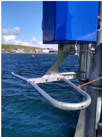
Handle for swinging crane.