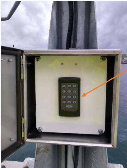
Fob reader with protective cover open.

Once activated via fob, the crane will remain powered up for 20 minutes, or until the fob reader is “Double fobbed”. To deactivate the crane, present your fob to the fob reader twice, in quick succession.